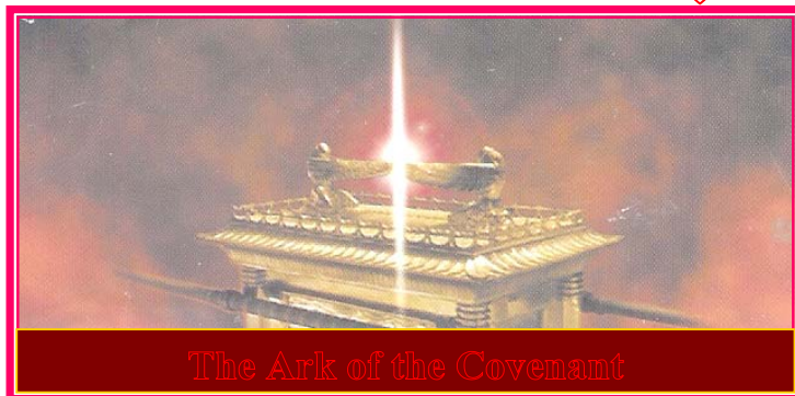
The Ark of the Covenant